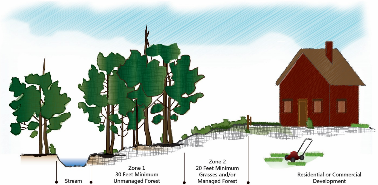
Figure 6-2 Buffer Example for Streams with Drainage Area \geq 100 acres