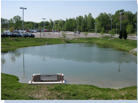
properly maintained and functional

Also known as wet ponds , retention ponds are designed with a permanent pool of water to facilitate the treatment of stormwater. These ponds prevent downstream flooding and allow sediment, nutrients, heavy metals, and other pollutants, to settle out. Deep pools of water, micropools, and shallow marshes, are three common types of retention ponds.