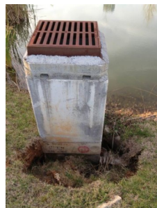
Erosion around overflow structure