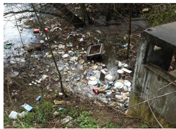
Trash around overflow structure