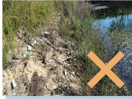
erosion and trash due to improper maintenance