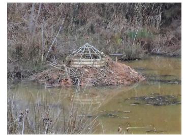
Beaver dam around overflow structure