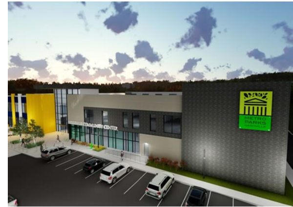
Bellevue Regional Community Center