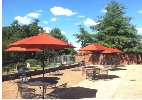
Centennial Art Center courtyard

Metro Parks Centennial Art Center or @MetroParks_CAC