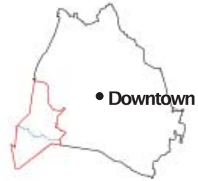
Figure 2: The Bellevue Community

Bellevue is a growing community. Subarea 6 recorded 37,062 residents in 2000, an increase of approximately 90% over 20 years, and is projected to have