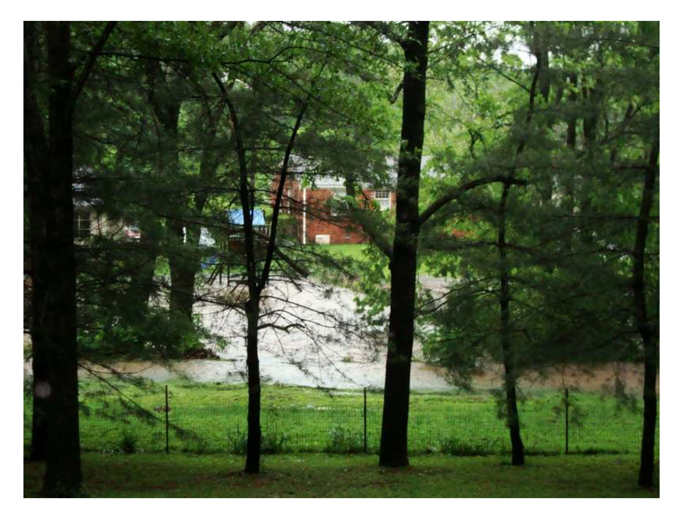
Taken from Lot 124 looking at Lot 128