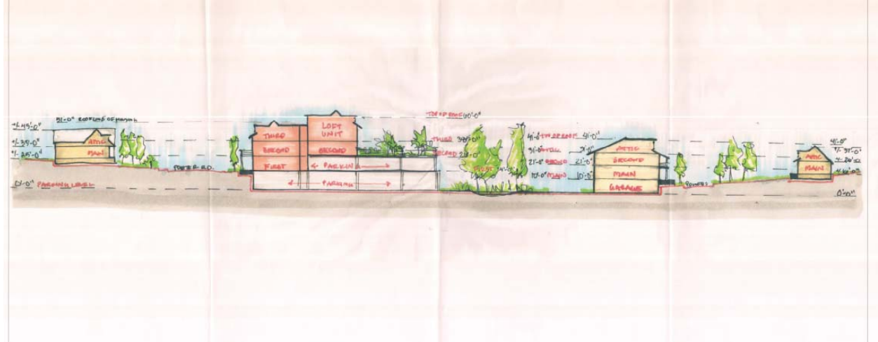
Site Section through Porter Road and Powers Avenue

achieve the proposed maximum height without overwhelming the surrounding area. A site section that illustrates the proposed building height in relation to existing structures on Porter Road and Powers Avenue is included with the SP and shown below.