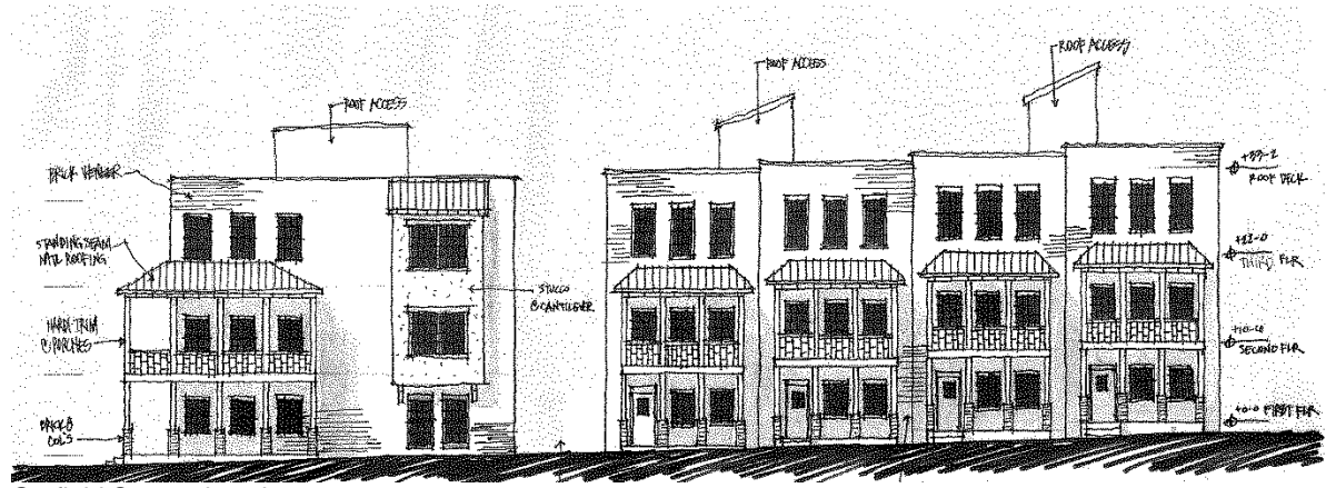
Garfield Street elevation

Front elevations have been provided for the units for both the Garfield Street frontage and 7 th Avenue North frontage. The proposed units have a height of three stories in a maximum of 45 feet, with roof access. The units are proposed to be primarily brick and feature double story porches. A raised foundation a minimum of 18" and a maximum of 36" will also be provided.