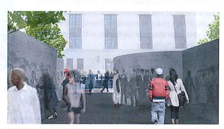
Walter Hood's original design concept for Witness Walls.

set of fragmented sculptural walls, recalling the