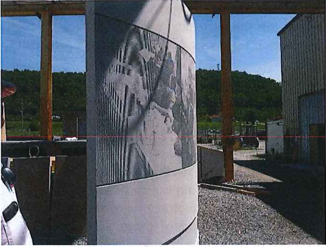
At a different angle, the same image is revealed at greater resolution.

publicart.nashville.gov explorenashvilleart.com