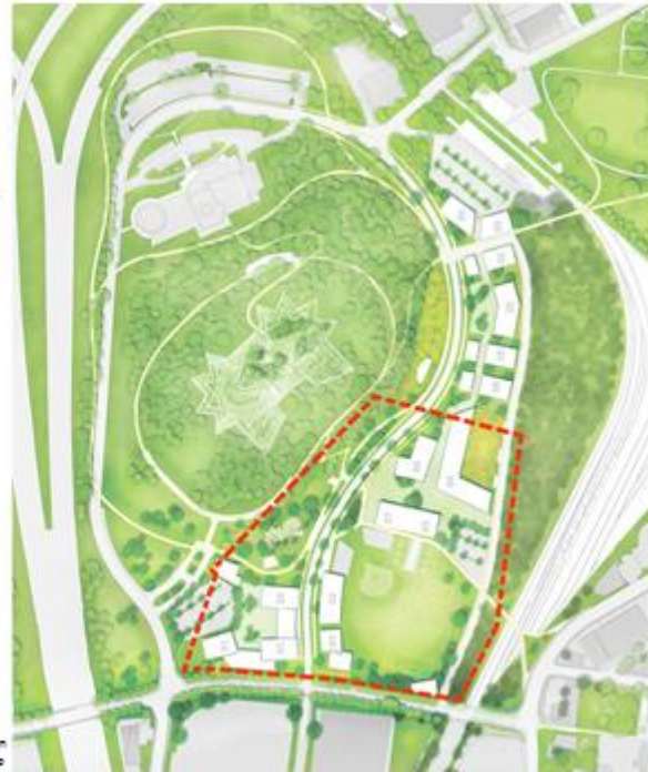
From: Detailed Plan Cloud Hill Partnership

At a minimum, Friends of Fort Negley believe if the City moves forward with this development: