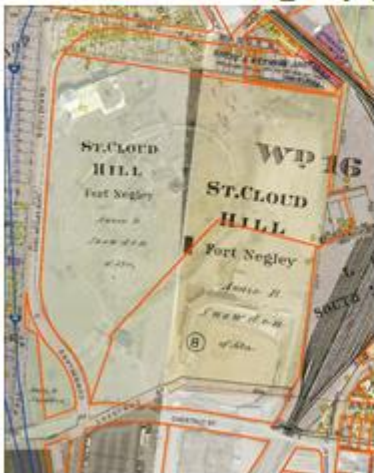
From: Metro Nashville Parcel Map

The Cloud Hill development encroaches on the Fort Negley parcel.