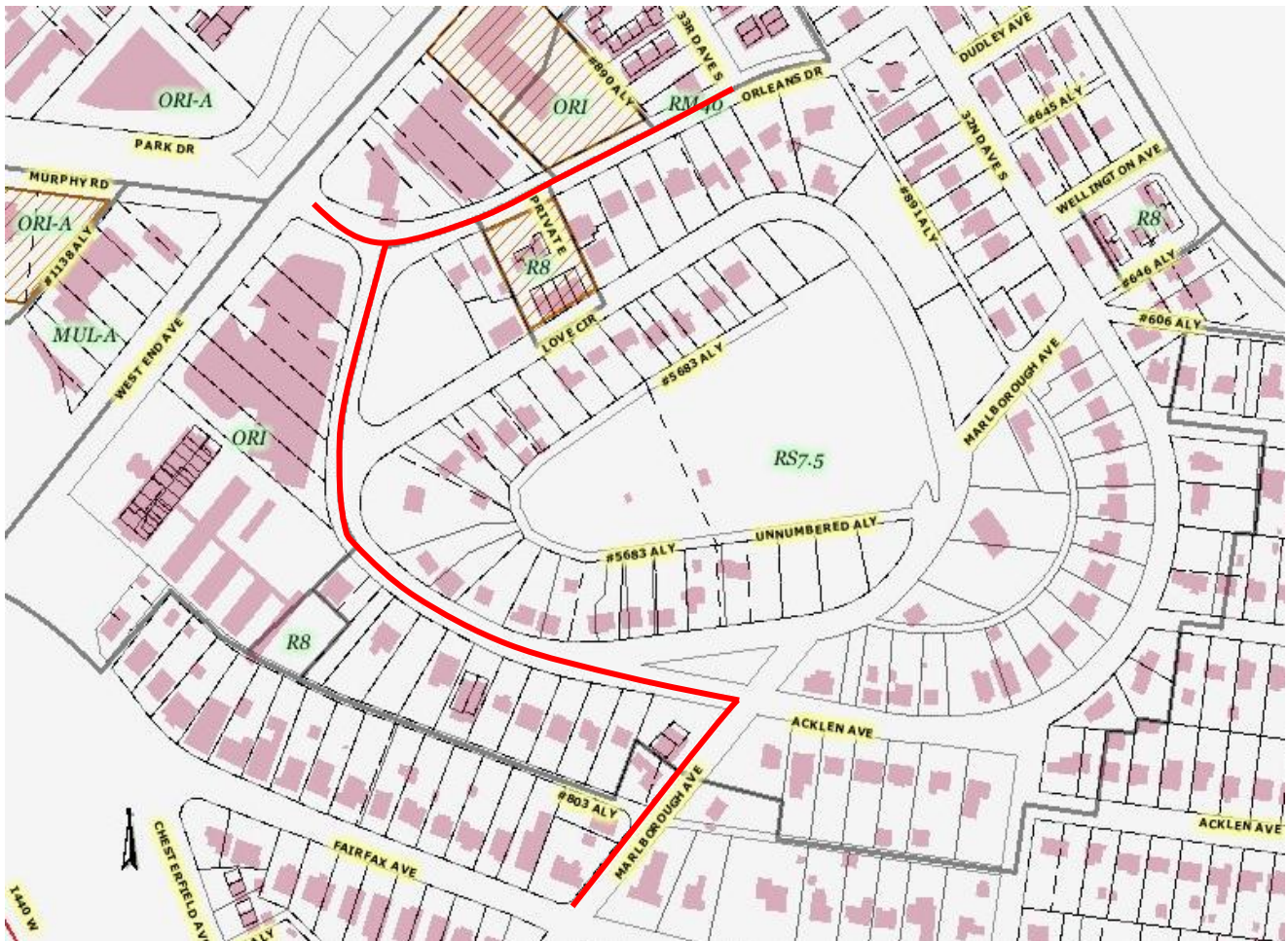
Figure 1. 5000lb Truck Restriction

Vanderbilt University operates a shuttle service which provides transportation to/from this area to/from the Vanderbilt University area. Anyone can use the service.