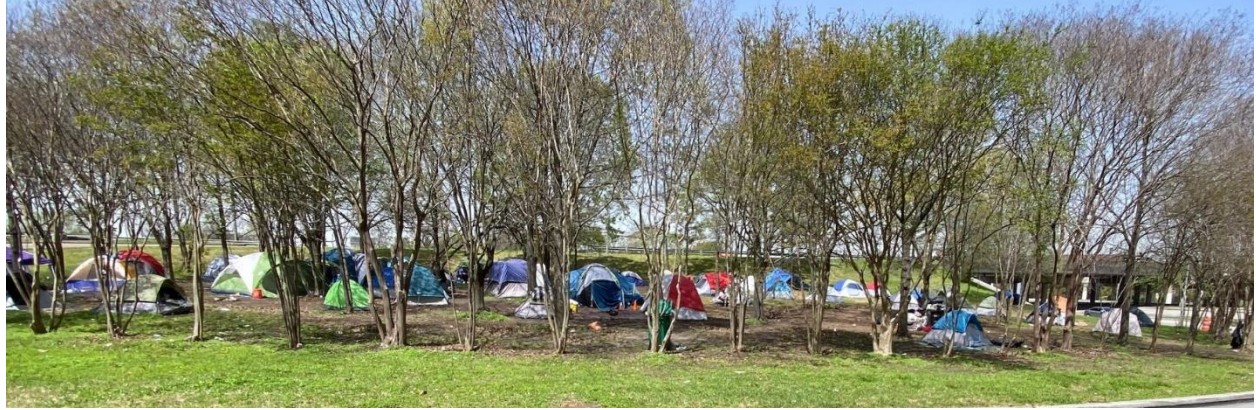
Figure 3. Allen Parkway After Housing Surge