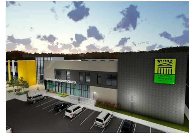
Bellevue Regional Community Center (opened in 2019)