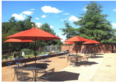
Centennial Art Center courtyard

Instagram: @metroparksvisualarts Facebook: Metro Parks Visual Arts and Centennial Art Center