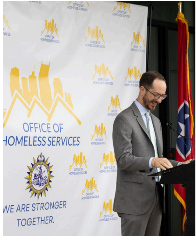
Mayor Freddie O'Connell