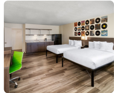
Hillside Crossing Living Space