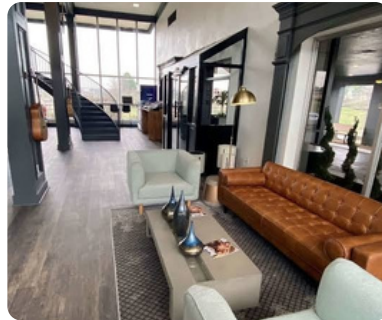
Hillside Crossing Lobby